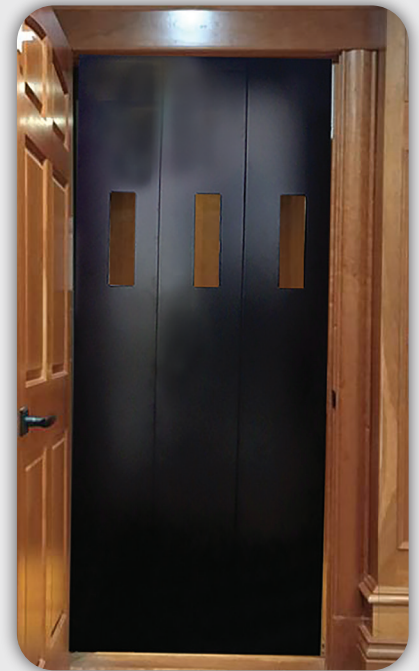
Symmetry Safety 3-Panel Door with Clear vision panels