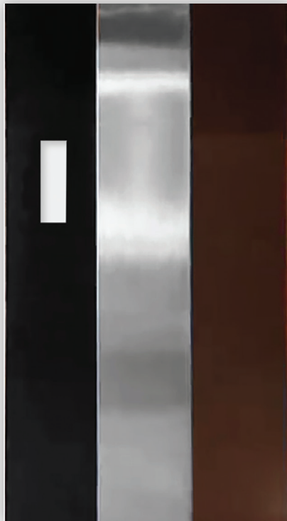
Shown in Black with vision panel, Brushed Stainless Steel and Vintage Bronze