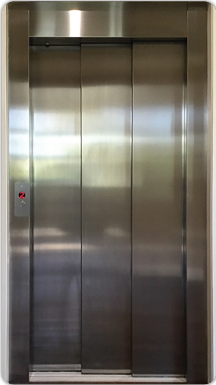
Three Speed Door in Brushed Stainless Steel