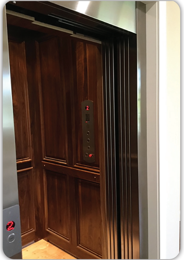
Three Speed Door frame in Brushed Stainless Steel