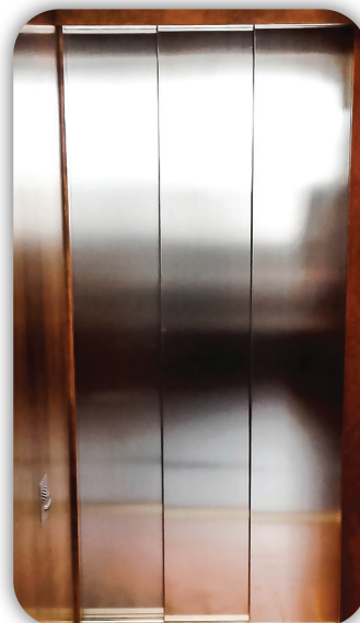
Three Speed Door in Brushed Stainless Steel