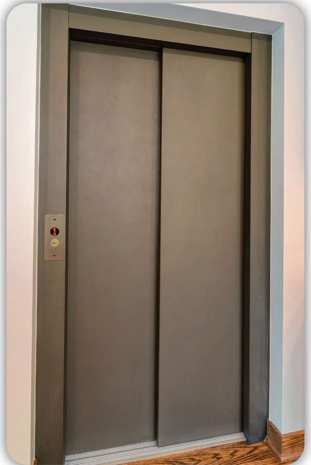
Two Speed Door painted in custom RAL

Colors illustrated may vary due to print or digital technology