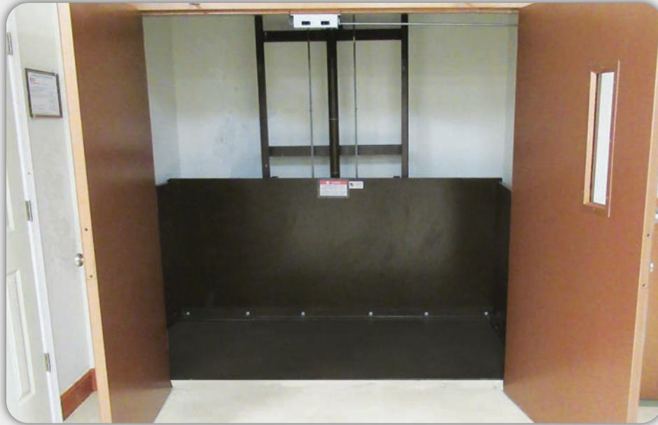
Single mast casket lift (model 1320) in custom color with fire-rated double swing doors