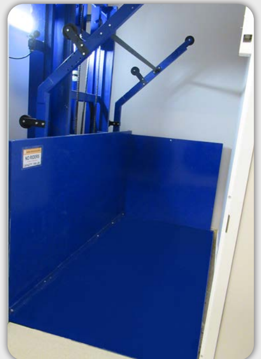
Telescopic casket lift (model 1520) in custom color