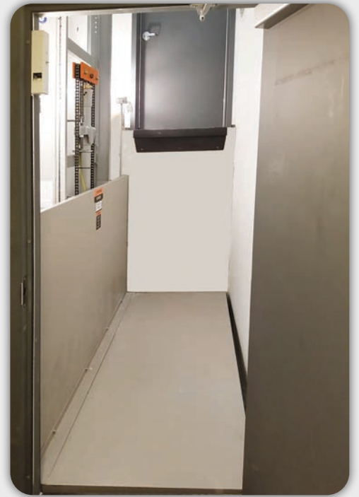
Single mast casket lift (model 1320) in standard Ivory