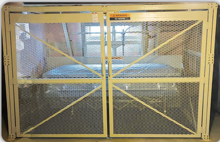
Double swing expanded metal gate enclosure (model 1520) in custom color