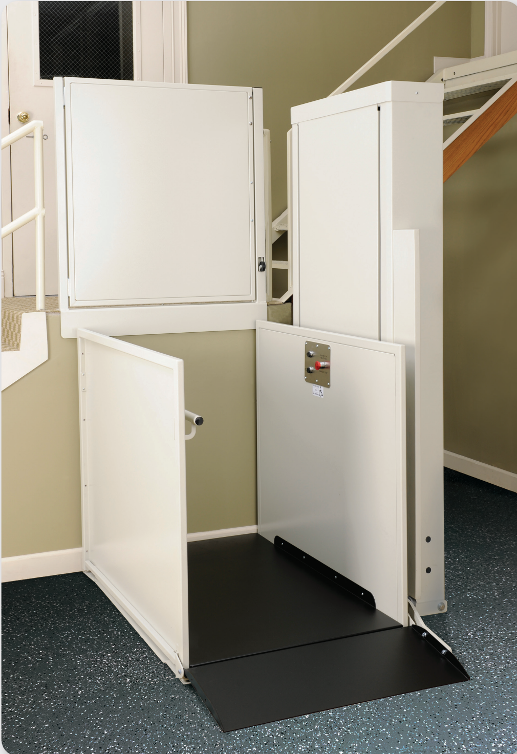
Shown with optional elevator style controls