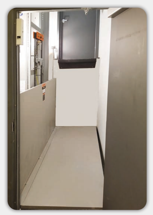
Single mast (model 1320) in standard Ivory