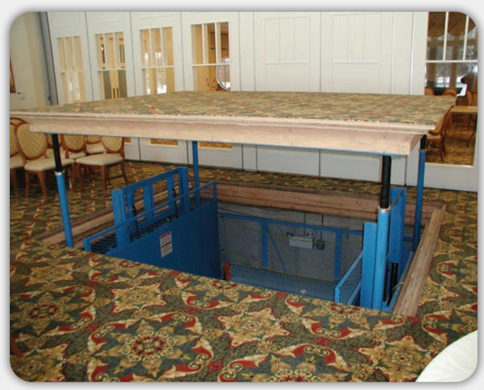
Telescopic mast (model 1520) in custom color shown with hatch cover