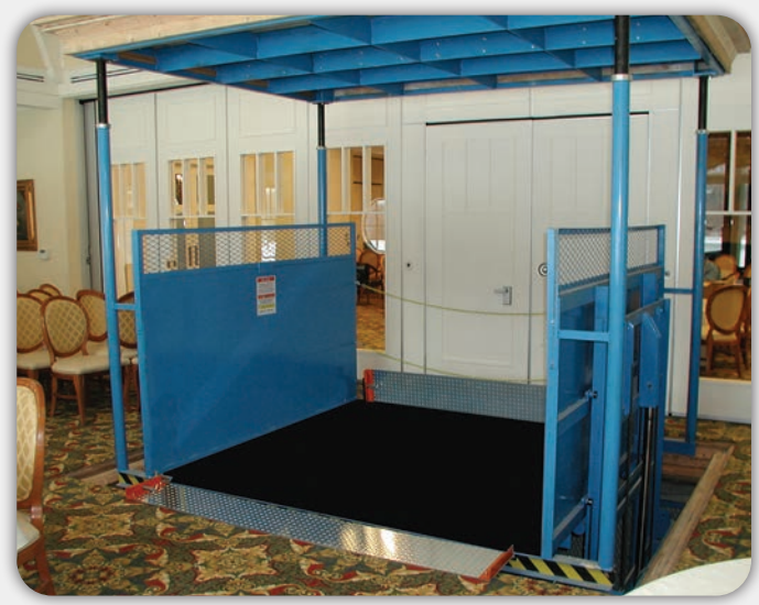
Telescopic mast (model 1520) in custom color shown with hatch cover at top landing with ramp \,