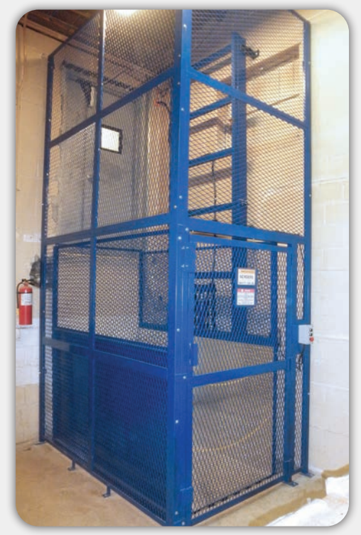
Expanded metal single swing gate and enclosure (model 1320) in custom color