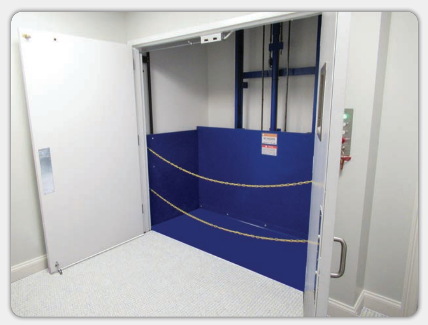
Single mast (model 1320) in custom color with safety chains