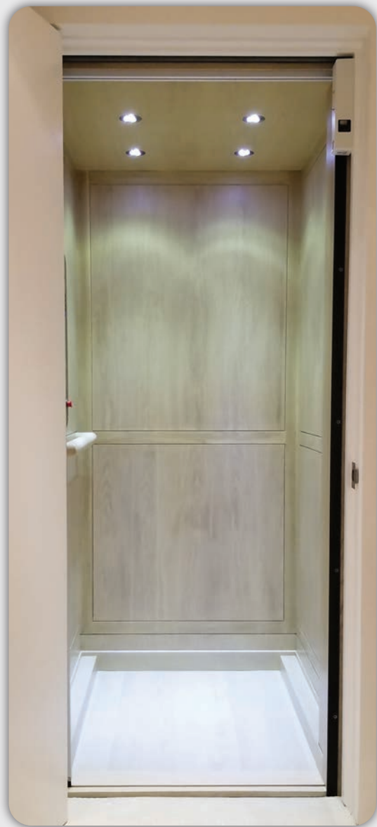
The car flooring and finishing shown is by others and required a 2½" threshold ramp

For Residential Applications where a pit is not feasible