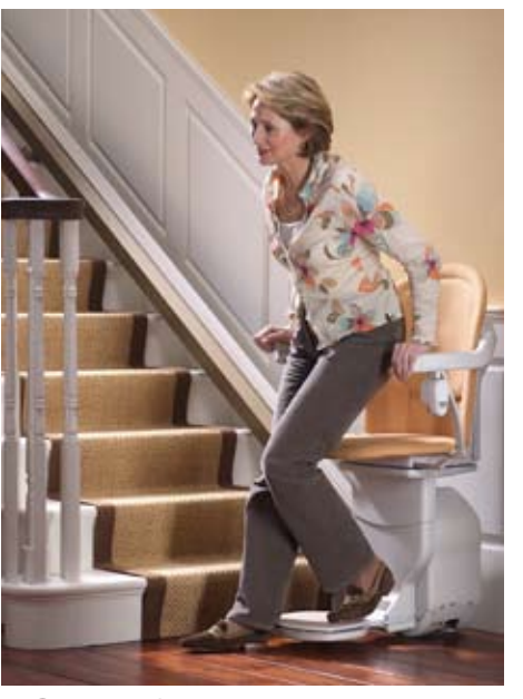
time as you need getting seated as our seat-load sensor ensures it will not move until you're safely in the chair.