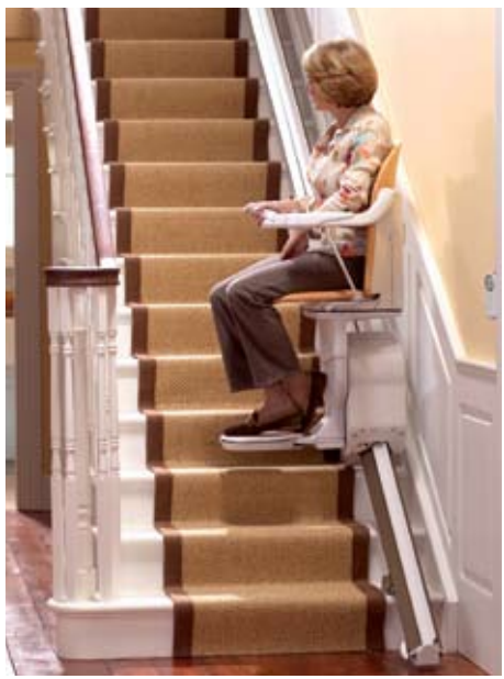
3. Gentle pressure on the easy-to-use control makes your stairlift move smoothly up or down the stairs.