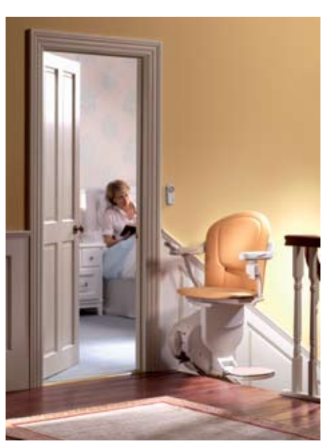
5. You can leave the stairlift in its swivelled position at the top of the stairs as an effective safety barrier or fold it flat against the wall.