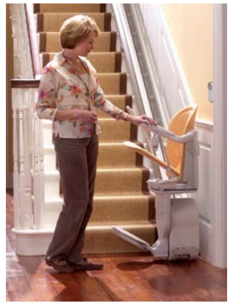
1. Unfolding a Sofia is exceptionally 2. Once unfolded, take as much easy, with a simple one-step folding action. Just lower the chair arm and the seat and footrest unfold with it.