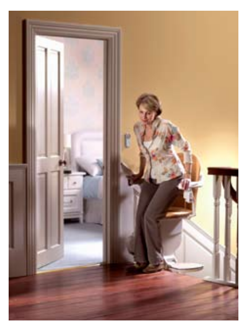
4. When you reach the top of the stairs, you can swivel the chair round to face the landing so you can get off in complete safety.