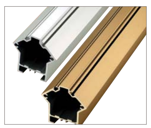
Straight rail available in bronze or silver